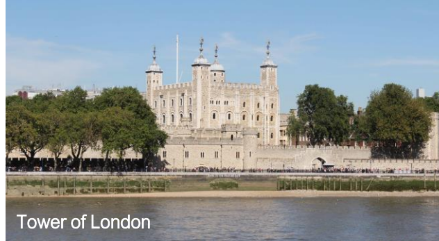
Tower of London